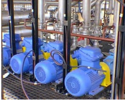
Figure 1: Ex equipment must be suitable for the explosive environment